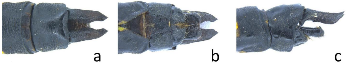
Figure 2. Cordulegaster insignis Schneider, 1845: male appendages a – dorsal view; b – ventral view; c – lateral view.

adequate literature, the author remains unsatisfied with this identification and states that examined museum specimens identified as Cordulegaster annulatus do not fully match the description of the Central European specimens. Finally, these two specimens, deposited in National Museum of Bosnia and Herzegovina in Sarajevo, were re-examined in 2013 (KULIJER and BOUDOT, 2013) and identified as C. insignis (inventory numbers APF12869 and APF12870).