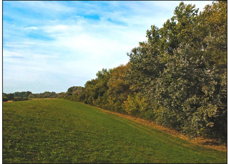
Figure 3. The habitat of Alcidodes karelinii at the embankment of the Tisa River in the Municipality of Ada.

Recent findings (2019-2022) in Hungary and our findings from Serbia suggest A. karelinii is spreading from the central part of the Eurasian steppe belt westward, towards Central Europe (SZÉNÁSI and VÁRI, 2019; SZÉNÁSI, 2020, 2023). SZÉNÁSI and VÁRI (2019) reported the first finding of this species in Hungary from Csongrád-Csanád county in southern Hungary, straddling the river Tisa, on the border with Serbia and Romania. Specimens were collected between the end of July and the beginning of August 2019, and the authors assume that A. karelinii arrived in Hungary just before that period. At that time, the nearest known locality was more than 800 kilometers east of Hungary, near Odesa in Ukraine (NAZARENKO and NEKRASOVA, 2011; SZÉNÁSI and VÁRI, 2019). Since 2019 this species has spread rapidly through Hungary (SZÉNÁSI, 2020, 2023). In 2020, SZÉNÁSI (2020) reported findings from the Bács-Kiskun District in southern Hungary, west of the Csongrád District, which borders Serbia to the south. In the same year, A. karelinii was reported from the town Szekszárd in the Tolna District, further to the west (SZÉNÁSI, 2020), which proves that this species crossed the Danube River. Since 2021, A. karelinii has been found regularly in south Hungary (Csongrád-Csanád and Bács-Kiskun Districts), and it has continued to spread further into Hungary, to the north, throughout the Pest District (SZÉNÁSI, 2023).