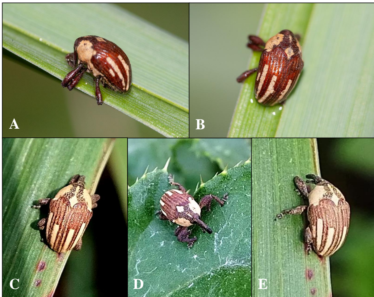
Figure 1. Alcidodes karelinii A-B - specimen from Ada, North Banat District; C-E – two specimens from Village of Bački Brestovac, Odžaci, West Bačka District.

Material examined: Vojvodina Province, North Banat District, Municipality of Ada, embankment of Tisa River, 45.810661N, 20.145515E, December 16 th , 2022, 1 specimen photographed (Fig. 1A and 1B), leg. D. Ugrnov, det. M. Tomić; idem , March 16 th , 2024, 1 female collected and photographed, leg. D. Ugrnov, det. F. Vukajlović; Vojvodina Province, West Bačka District, Municipality of Odžaci, Village of Bački Brestovac, 45.637029N, 19.287100E, September 25 th , 2023, 2 specimens photographed (Fig. 1C, 1D and 1E), leg. B. Rapajić, det. F. Vukajlović. A single collected female specimen from Ada was prepared, sexed, and deposited in the weevil collection of Prof. Dr. Snežana Pešić, at the University of Kragujevac, Faculty of Science.